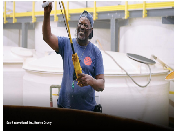
San-J International, Inc., Henrico County

Chief Financial Officer, Volkswagen North American Region and Volkswagen Group of America