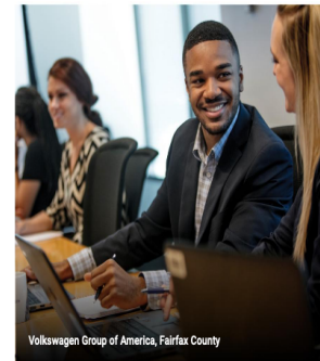
Volkswagen Group of America, Fairfax County

But we have over 600 Volkswagen and 300 Audi dealers all over the country. We need to travel a lot, and with Washington Dulles International Airport and Ronald Reagan Washington National Airport around the corner, that's absolutely helping [us] conduct business.