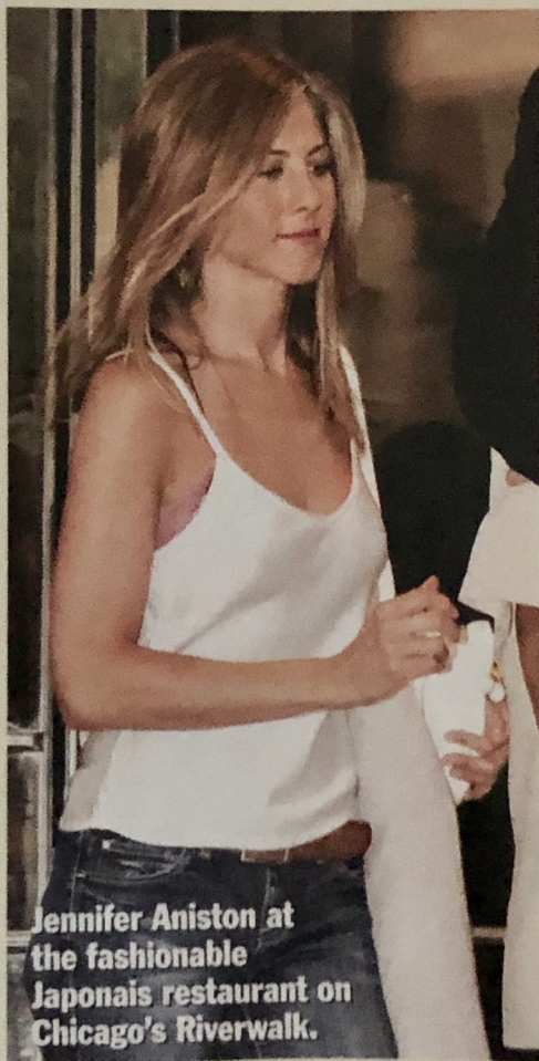
Jennifer Aniston at the fashionable Japonais restaurant on Chicago's Riverwalk.

While it has been speculated that Jen and Vince are more than just friends, an observer reports that their rapport appeared strictly platonic. "They all seemed to be having a nice dinner together," said a spy. Jen indulged in a New York strip steak and a few items specially selected by the server.